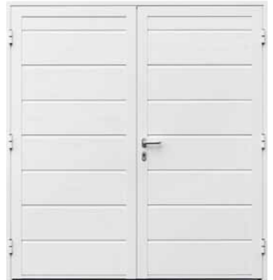
Broad surround, opening outwards